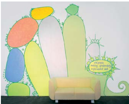
Old People Making Spectacularly Experimental Art , 1999, acrylic on wall and couch, approx. 14 by 11 feet.

all of us have some similar health-care experiences. I see the work as recording the reality of people my age. All of my peers, friends I still know from childhood and art school, have various illnesses now: some chronic, some deadly. It's really scary, but we have no other choice than to deal with it.