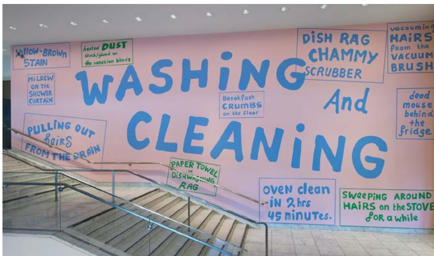
Two views of the exhibition "The Tidy Kitchen," 2019, acrylic on wall.

to have solidarity across age groups in our communities, and to find ways to respect each other's differences.