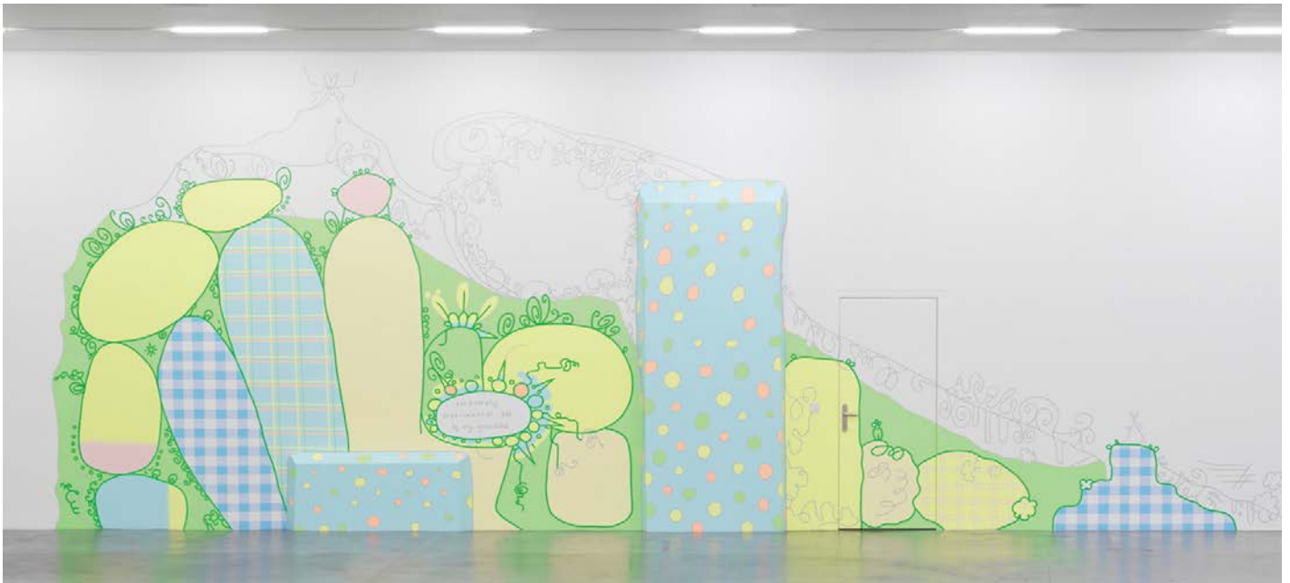
Extremely Experimental Art by My Grandma , 1999/2019, acrylic on wall and wood, approx. 14 by 41 feet.